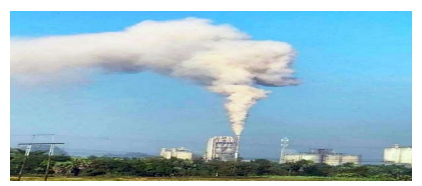
Figure 2: 4000 Tonne cement factory in Myaing Kalay, Hpa- an

Coal using power plants are located in Myaing Kalay village, west bank of Than Lwin River, Hpa-an township, as cement factories. These factories produce 900 tons and 4000 tons daily. Cement produced is distributed-around Myanmar and widely used in various construction services.