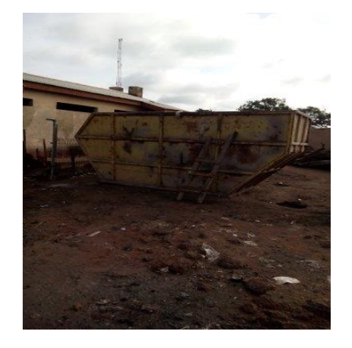
Bad Waste Disposal