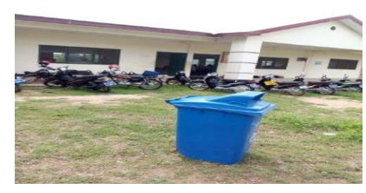
Bad Disposal of waste