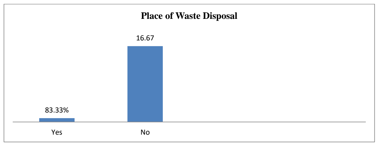
Figure 1: Disposal of Solid Waste in Senior High Schools within Wa Municipality

One aspect of the questionnaire also gathered data from respondents on where they dump waste in senior high schools within the Wa Municipality and the responses are presented below.