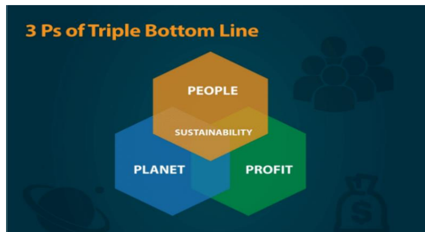
Figure 1. The 3Ps of sustainability (planet/people/profit).

the public institutions and increase accessibility for suppliers to information. Refs. [10,11] conducted an equilibrium study on the optimal E-procurement platform to be adopted by enterprises with diverse technological perspectives. Furthermore, Ref. [16] investigated and studied the elements that impact E-procurement acceptance among SMEs on the south shore of Massachusetts. To comprehend the Hong Kong E-procurement system, the researchers conducted a questionnaire-based study and concluded that, without the implementation of E-procurement technology, the supply chain of a business cannot be interconnected properly [8]. Moreover, the researchers conducted scientific studies in Australia on firms' transportation and logistics and found the major aspects of decision-making on E-businesses. The credibility of previous research, which successfully predicted developments and adjustments produced by e-contracting technologies, is assessed by [7]. Moreover, a researcher conducted a study on the Singaporean printing industry, namely on the implications of combining decision-making with the e-buying of buyer-supplier interactions. The 3Ps of the triple bottom line (sustainability) is shown in Figure 1.