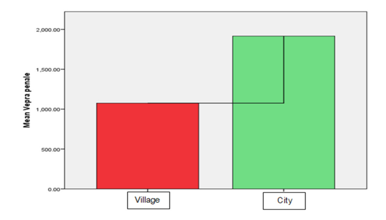
Graph 2: Crimes by social origin in the region of Gjilan from ALFA to EPSILON, by social origin (rural and urban regions).

Based on the findings, we reject the hypothesis that there is no difference in the commission of crimes by people of different socioeconomic backgrounds (rural vs. urban) in the Gjilan region. As a result, we conclude that the alternative hypothesis, that there are disparities in committing crimes by social origin (rural and urban regions) in the Gjilan region, is statistically valid.