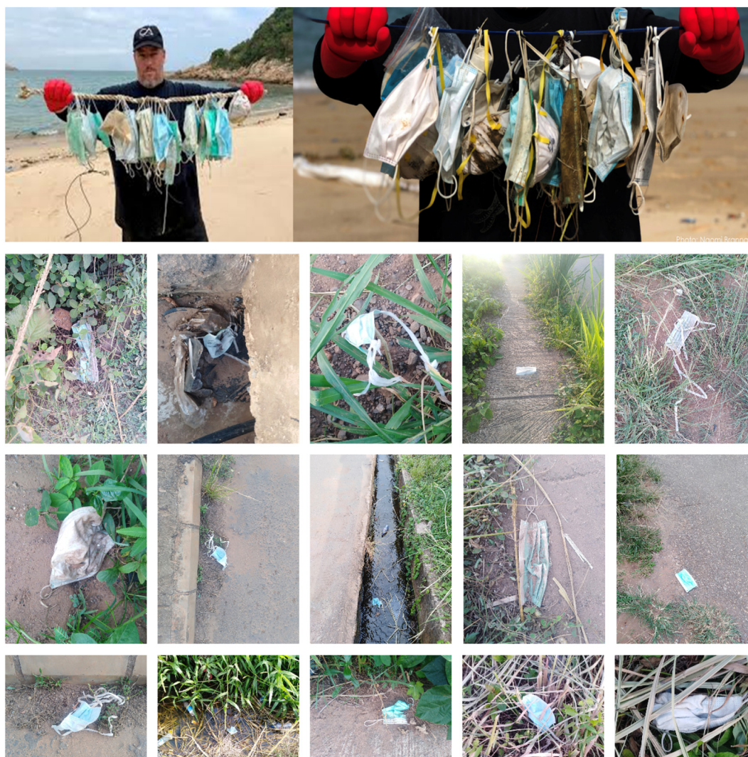
Fig. 2. Collection of various Covid-19 face masks of different types and colours from an ocean and terrestrial environment in Hong Kong and Nigeria respectively. (For interpretation of the references to colour in this figure legend, the reader is referred to the web version of this article.)